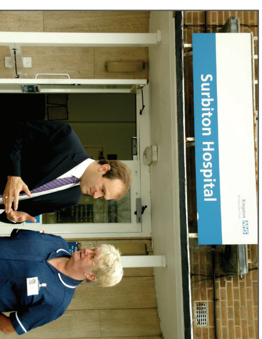
• MP Edward Davey speaks to staff during the campaign to save Surbiton Hospital

The hard bit, inevitably, will be winning the funds we need. With the NHS hit by budget deficits, we may have to rely on the ingenuity of local GPs and strong partnership working with Kingston Council. We have such a strong case, I'm determined to campaign at all levels till we win.