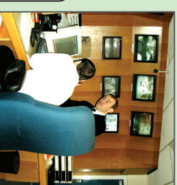
Edward visits Kingston's CCTV control room

Safer Neighbourhood Police Teams are now in every local community in Kingston, and significantly increase police presence on the streets. Most types of crime in Kingston are falling, with violent crime down for the second year running. There is much still to do, but we must avoid a return to the years of cuts to police we saw in the past.