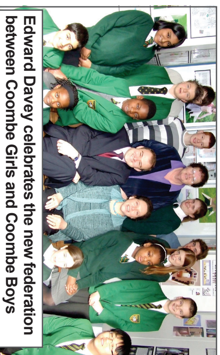
Edward Davey celebrates the new federation between Coombe Girls and Coombe Boys

The complete rebuild of Chessington Community College in the next few years is the largest project. New links with nearby schools to offer pupils a wider choice of subjects, including new vocational options, will