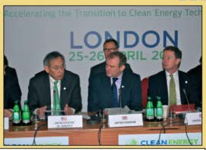
Edward hosting the Clean Energy Ministerial - a meeting of 23 leading nations to discuss how we accelerate progress on renewable energy and energy efficiency.