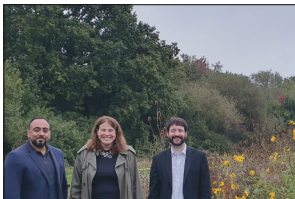
Celebrating the new biodiversity plan