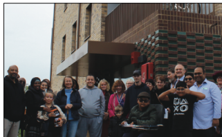
Opening of new council homes, Arun House