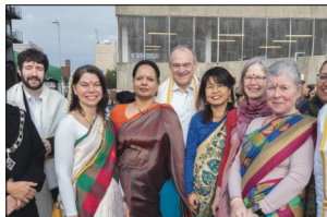
Tamil Heritage month celebrations