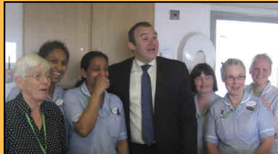
Edward Davey speaks to staff of Kingston's Your Healthcare at Tolworth Hospital. They are leading significant improvements to many of our community health services.

Last year's campaign to save Kingston Hospital's Accident and Emergency and Maternity Units from closure under the Labour Government's NHS plans also looks as if it has been successful. However, all London's hospitals are still facing massive financial pressure and it's clear we will see significant cuts at